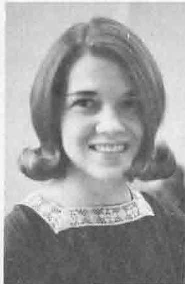
Kathleen E. Stephens